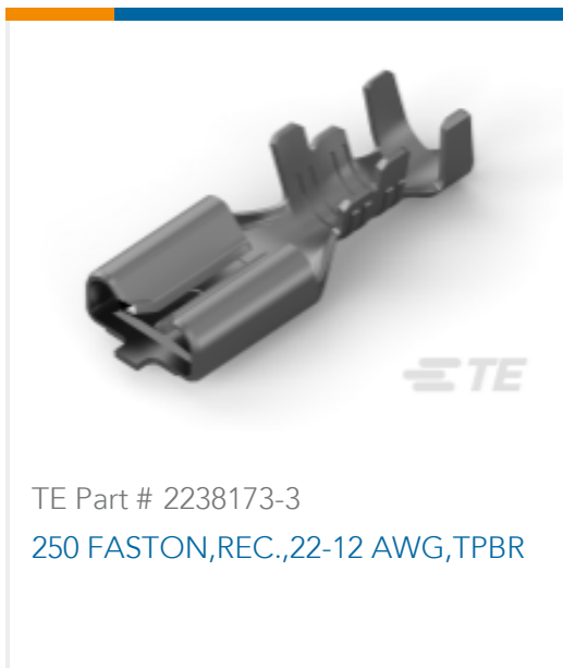
TE Part # 2238173-3 250 FASTON,REC.,22-12 AWG,TPBR